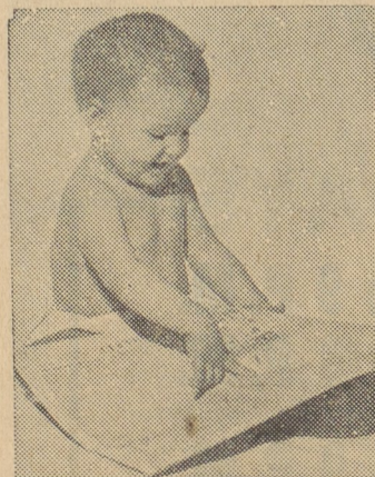
This is one time I can believe what I read in the papers.