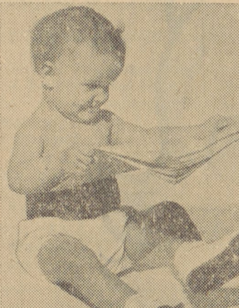
Oh, my goodness!