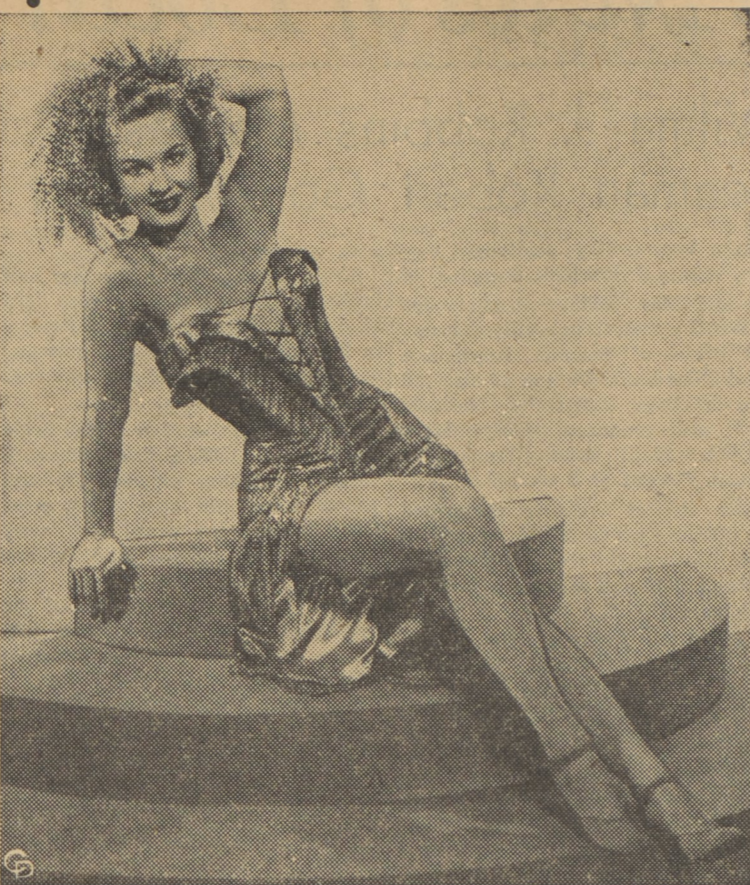
WE WON'T BE AROUND to see it, but actress Virginia Mayo's prediction is a pleasant one anyway. She models a costume which she says the ladies will wear 1000 years from now. This photo, along with many others, will be put in a steel capsule and preserved for 10 centuries in the Pershing Square Foundation. Los Angeles.