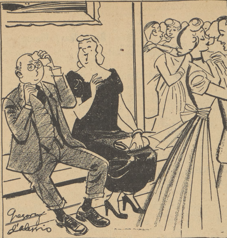
"Remember when we used to sit out dances, Fred—when it wasn't just to rest?"