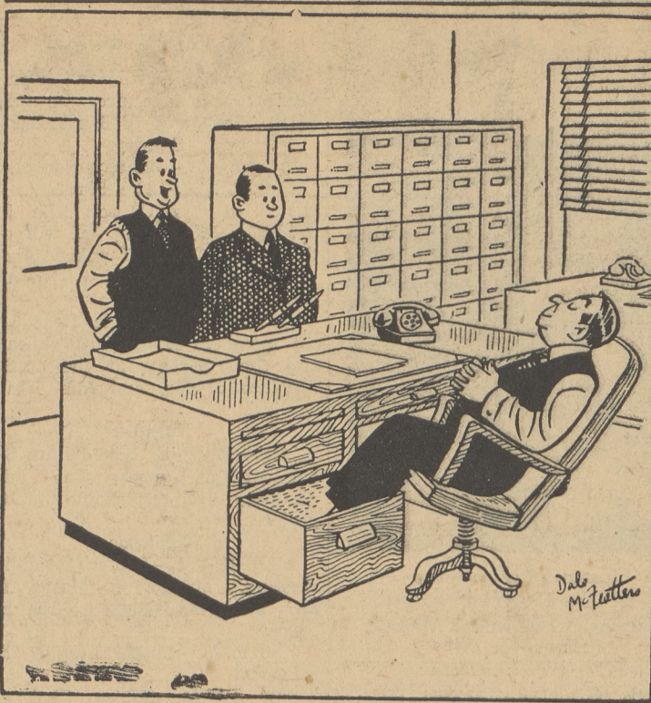
"Last time the boss caught him sleeping he gave him a hotfoot!"