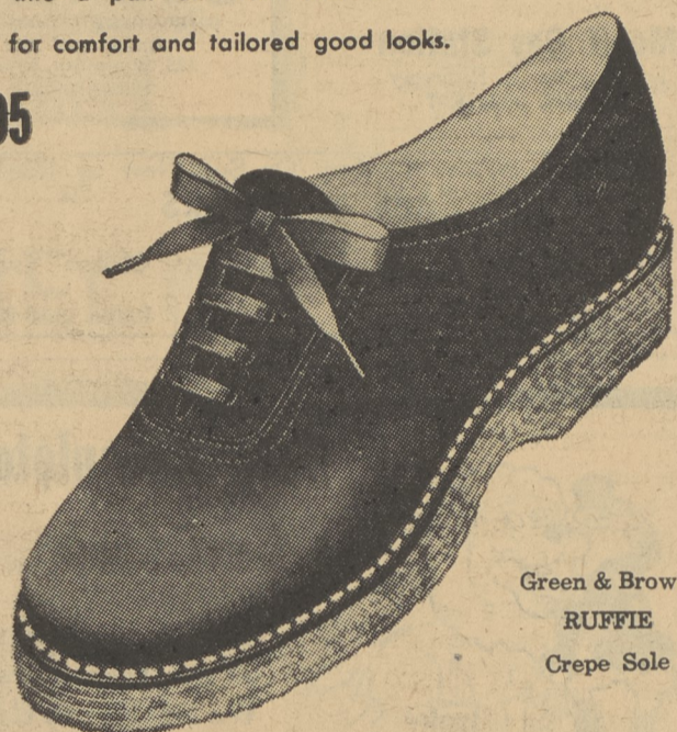
Green & Brown RUFFIE Crepe Sole