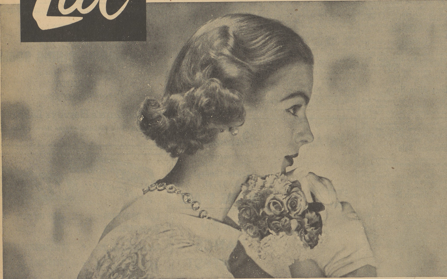
Your Lilt wave will look far more like the most glorious Naturally Curly Hair... feel far more like the softest Naturally Curly Hair... behave far more like the easiest-to-manage Naturally Curly Hair!

No Other Home Permanent Wave looks...feels...behaves so much like the loveliest Naturally Curly Hair!