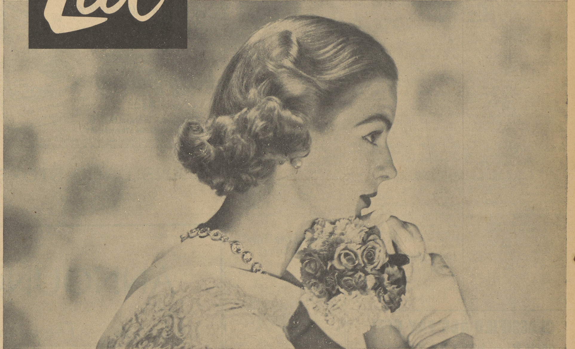
Your Lilt wave will look far more like the most glorious Naturally Curly Hair... feel far more like the softest Naturally Curly Hair... behave far more like the easiest-to-manage Naturally Curly Hair!

No Other Home Permanent Wave looks...feels...behaves so much like the loveliest Naturally Curly Hair!