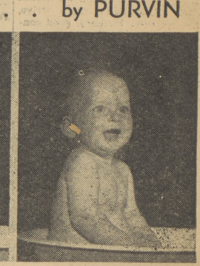
Bringing me my delicious PURVIN'S MILK, natch!

FOR REGULAR DELIVERY IN THE BACK MT. AREA, CALL W.-B. 2-8151-COLLECT