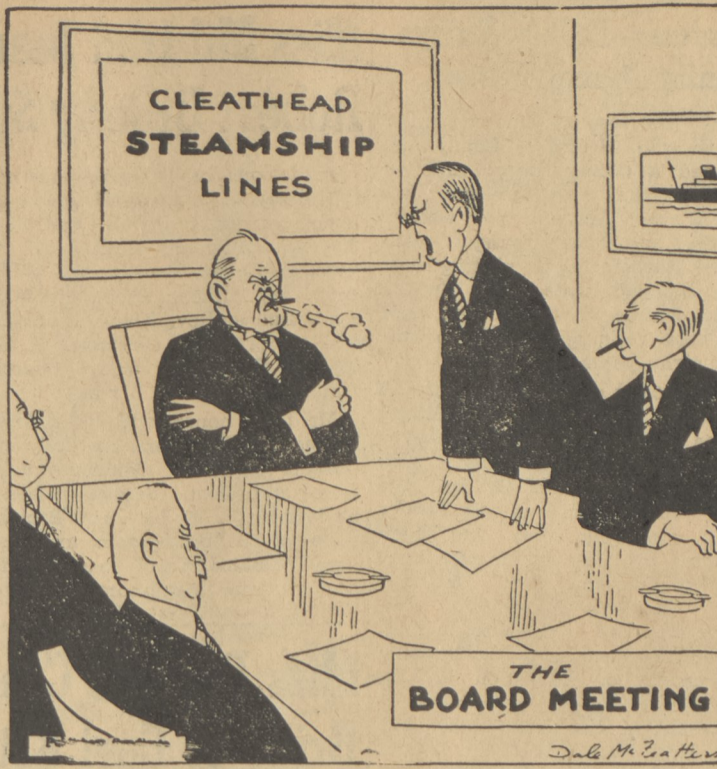
"Cleathead, that's the second of our ships you lost in a poker game!"