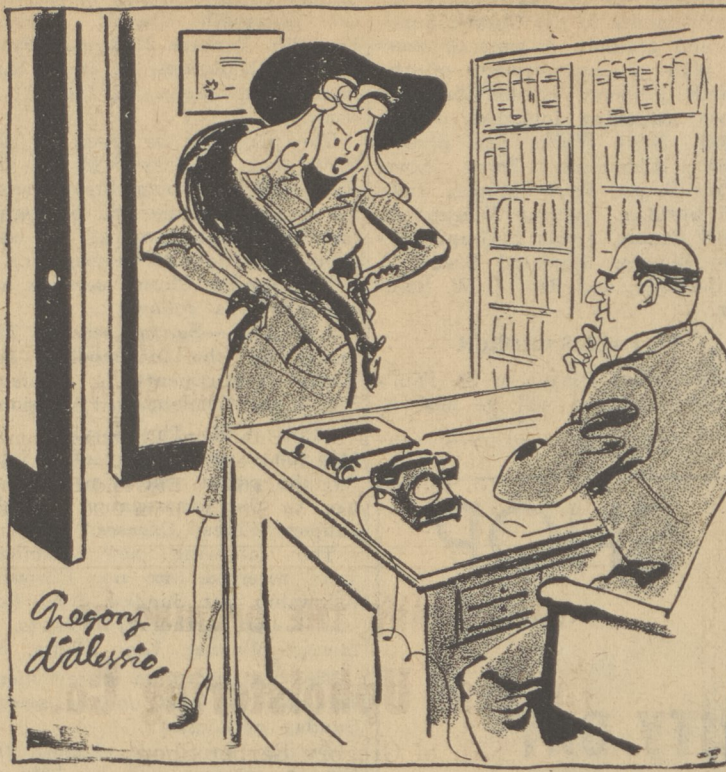
"Can he do that to me—go to jail instead of paying alimony?"