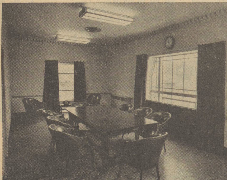
The new Directors' Room is at the front of the Bank on the second floor. Red leather upholstered chairs and maroon drapes are in pleasing contrast to walls of Williamsburg green.

This Institution Which Has Served The Back Mountain Community Through Good Years And Bad Since 1906 Is Proud To Present