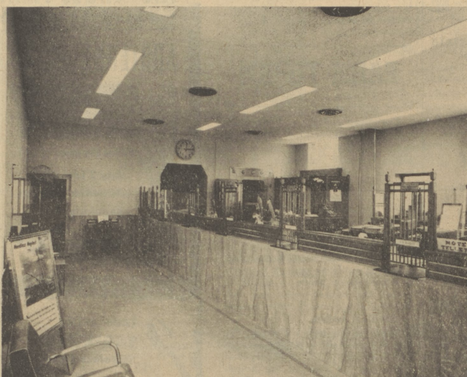
The Customers' Room has been enlarged to meet the growing requirements of the Bank and Community. The entire Bookkeeping Department has been moved to the second floor and new private offices have been provided for President and Cashier.

This Institution Which Has Served The Back Mountain Community Through Good Years And Bad Since 1906 Is Proud To Present