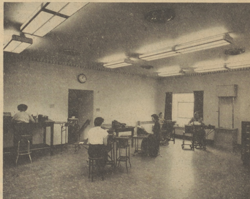
A section of the Bookkeeping Department on the second floor. Here ample space is provided for future expansion. The most modern accounting machines are used in this department. An elevator transports ledgers from first floor to second.