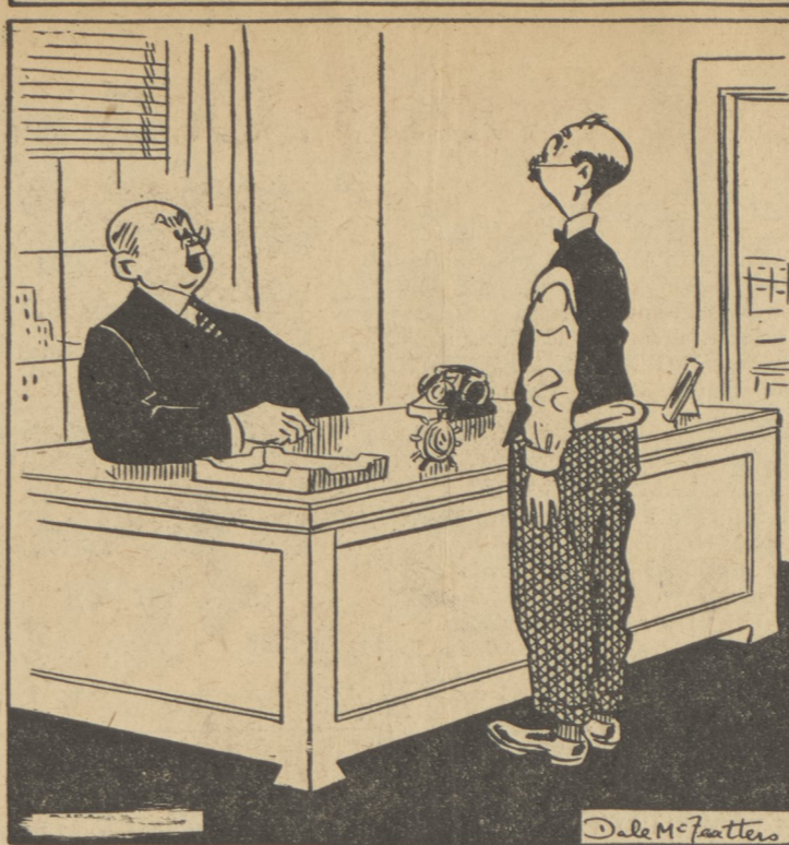
"Naturally you don't have to agree with my opinion, Meekle—you can resign!"