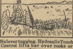
Never tugging. Hydraulic Touch Control lifts bar over rocks or stumps.