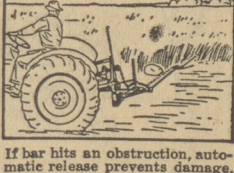
If bar hits an obstruction, automatic release prevents damage.