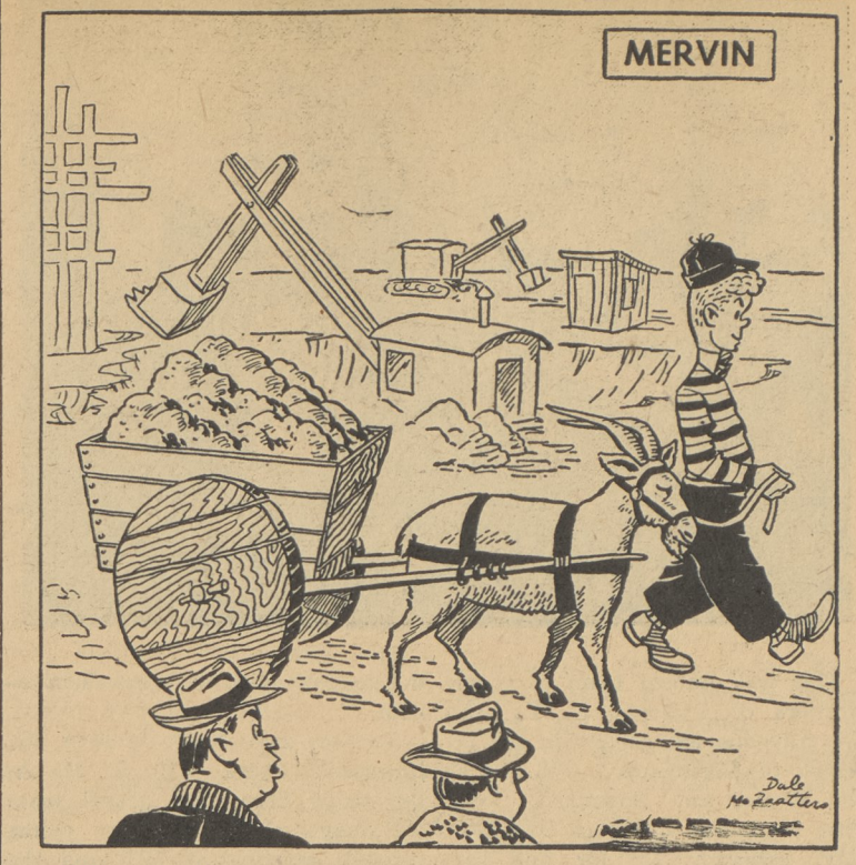
"It seems he put in the lowest bid for this hauling job!"