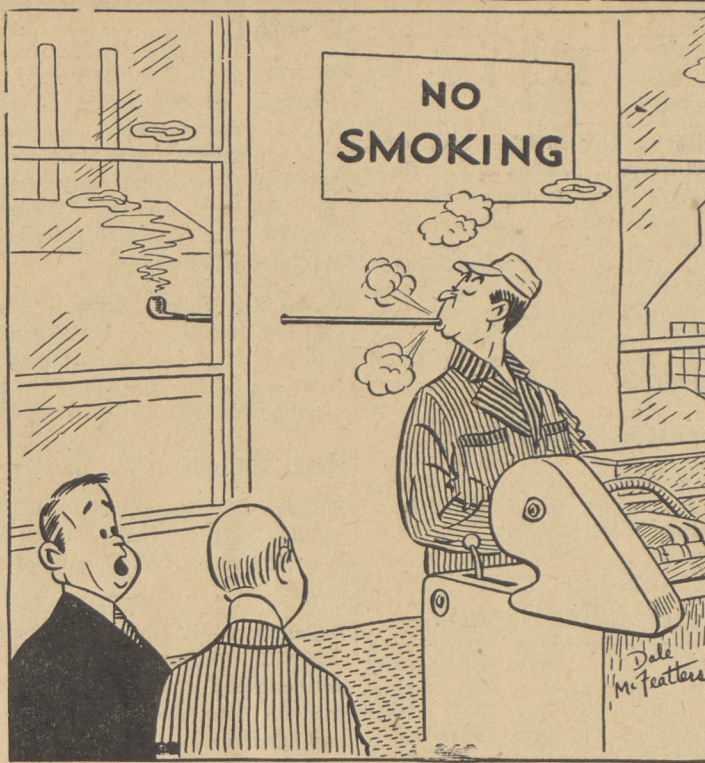
"We can't decide whether or not he's violating regulations!"

the cellar position with Laketon, defeated Lehman, currently in fourth place, 7 to 5. Then Lehman turned around and took Harter, top team in the league, 1 to 0. Try to figure it out. . .