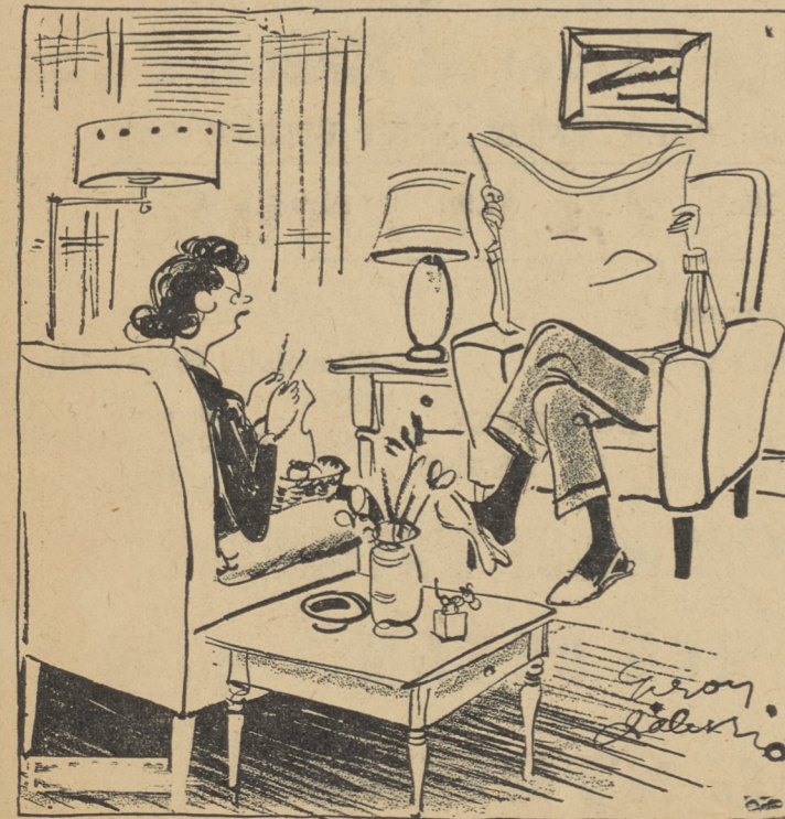
"Are you listening, Dear? You haven't given your paper a shake of annoyance once since I've been talking!"