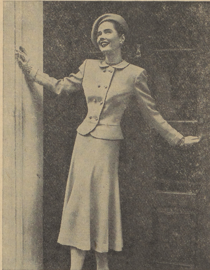
One of six favorite suits for Easter is shown above as pictured in the March issue of Good Housekeeping. Gracefulness is the keynote of this tight-waisted gray suit, with a curve of collar and a swing of skirt. It is available in sizes 10 to 16 and costs about $45.