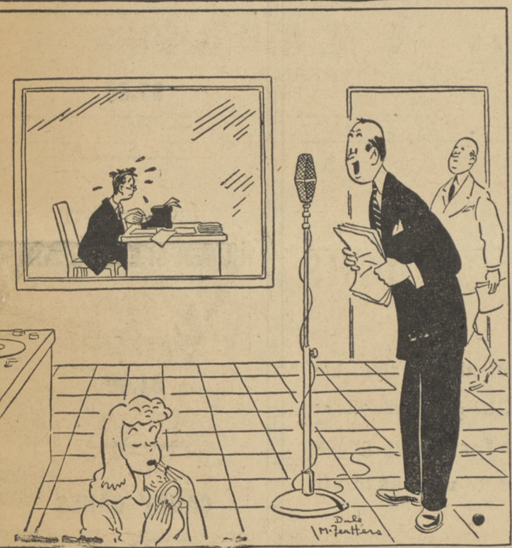
"Will Joan speak to Rodney again? Will Cedric save little Edgar from the mad Dr. Zukki? Will Scroggins finish tomorrow's script on time?"