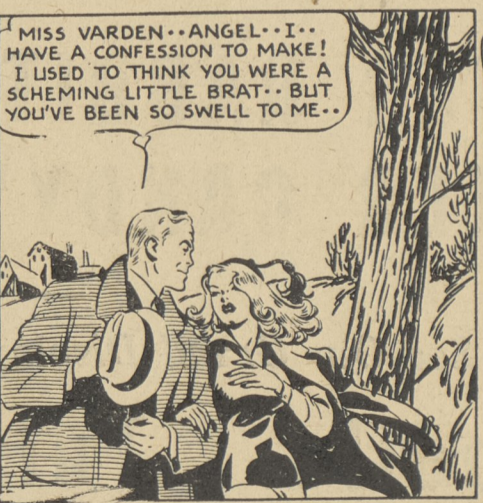
By GENE BYRNES