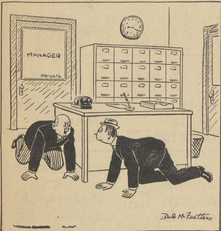
"Late again, Firson?"