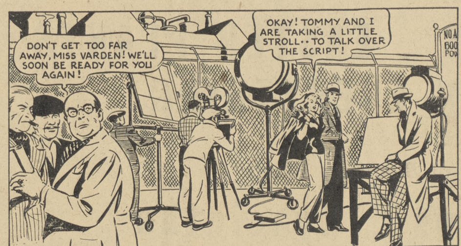
REG'LAR FELLERS Pop Will Have To Wait