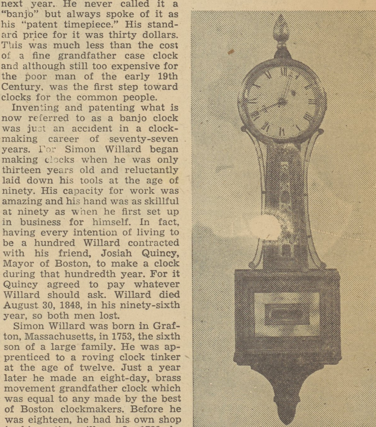
A SIMON WILLARD BANJO CLOCK

"banjo" was just one of many types He had other clocks to his members of his family. Probably no credit that he considered much finer, less than thirty clockmakers copied such as the one the United States this design. Some put their name on Government paid him $750 for mak- the dial, others left their clocks uning in 1801 and which had such an marked.