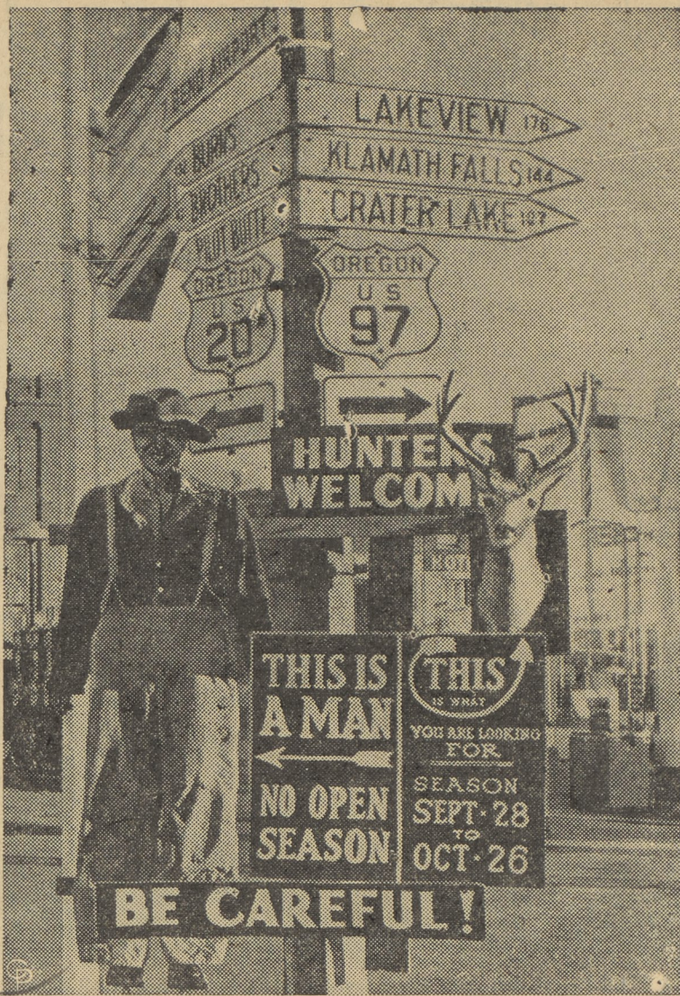
IN AN EFFORT to lower the number of hunting accidents in the Ochoco and Deschutes forests of central Oregon, where mule deer abound, citizens of Bend, Ore., have erected the above warning on a main highway. Thousands of hunters go this way to the big woods.