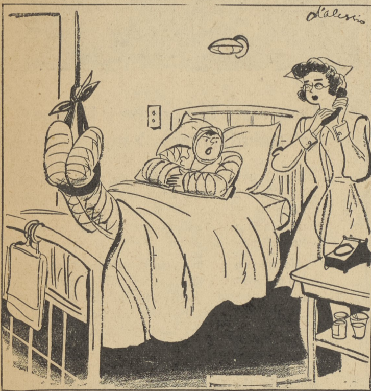
"Oh, tell him I have a headache or something!"