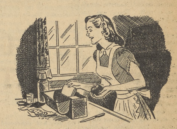
Held by millions of Americans, bonds will provide a reserve to assure jobs for veterans. for other workers. They will help maintain prosperity for you and your community.