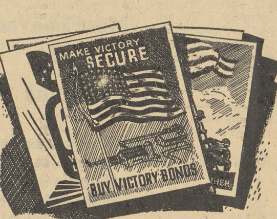
Seven times during the war you've been asked to buy extra bonds to win Victory. Our fighting men have finished their job . . . let's finish ours! Buy extra bonds now!

Victory Loan and how important it is to you and the business of your farm to buy EXTRA bonds in this final loan!