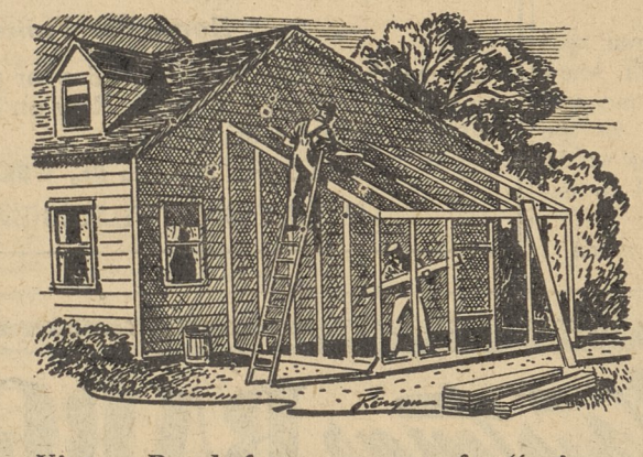
Victory Bonds form a reserve for "rainy days," provide a backlog for needed farm repairs, for buildings, improved stock . . . if current income fails to cover them.