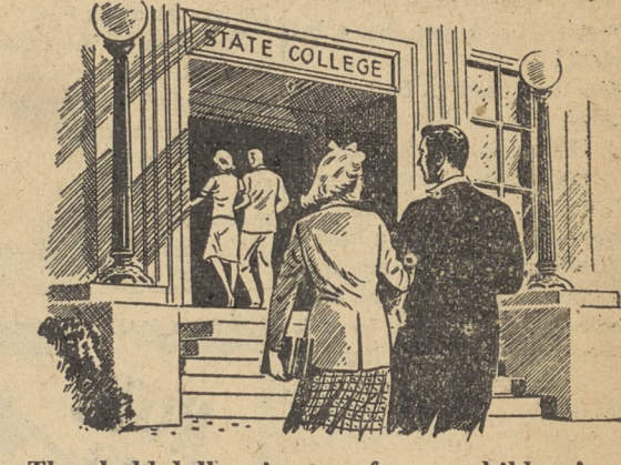
They hold dollars in store for our children's education. Victory Bonds purchased today, will provide the scientific training so necessary in the world of tomorrow.