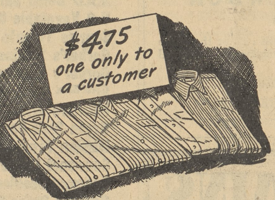
By buying bonds rather than scarce goods, we help keep the lid on prices...keep our pledge to fighting men to guard their dollars' value. We prevent inflation . . . and depression.