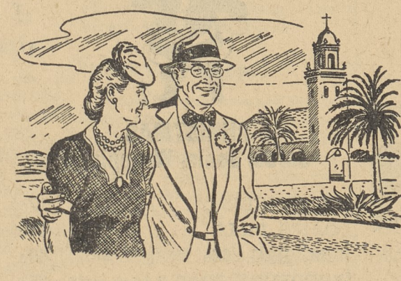
Buy Victory Bonds to start your own annuity fund. Followed up with regular purchases of U. S. Savings Bonds, Victory Bonds will permit you to enjoy later years in comfort.