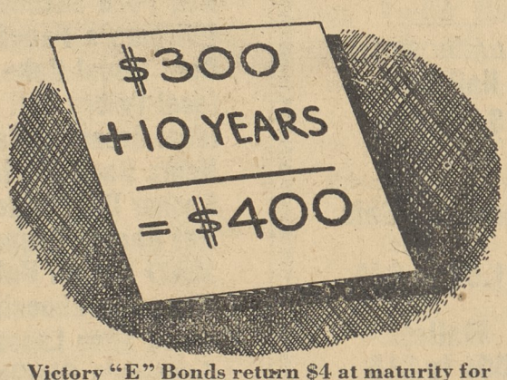
Victory "E" Bonds return $4 at maturity for every $3. The safest investment in the world after 60 days, they are immediately convertible into cash if necessary.