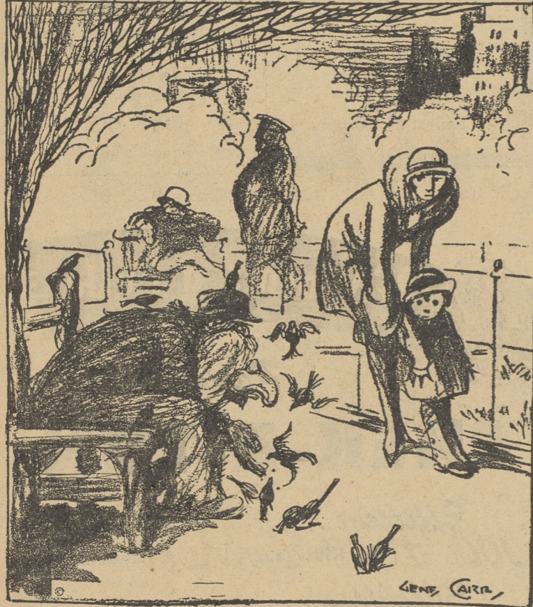
"Don't Go Near That Terrible Person, Oswald!"