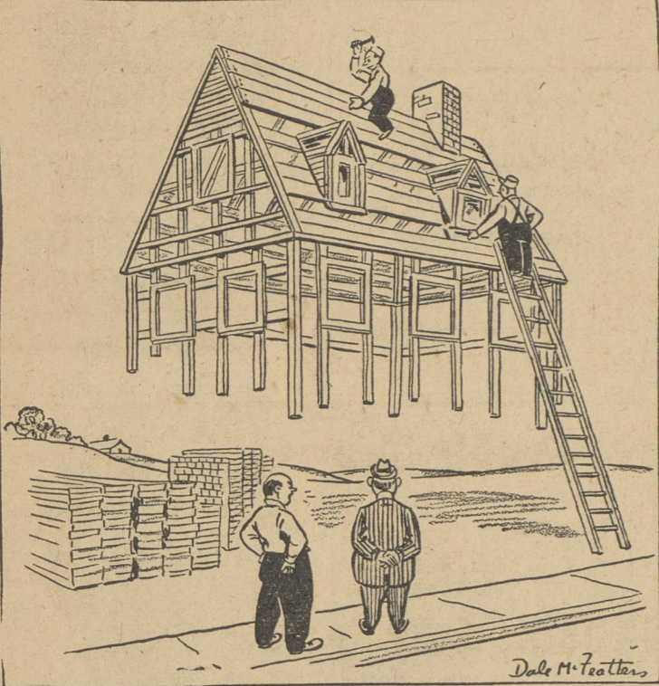
"All right, you tell 'em it's impossible to build a house from the roof down!"