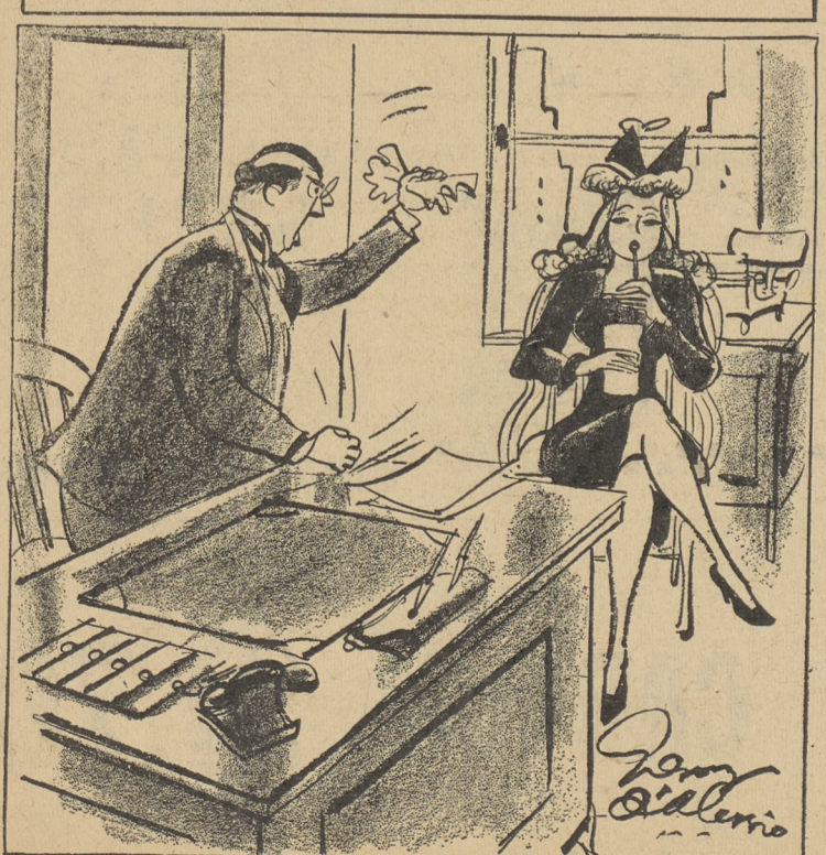
"Now look here, Miss Shaw, I'm getting impatient with your poor work. I'll give you just fifty more chances!"