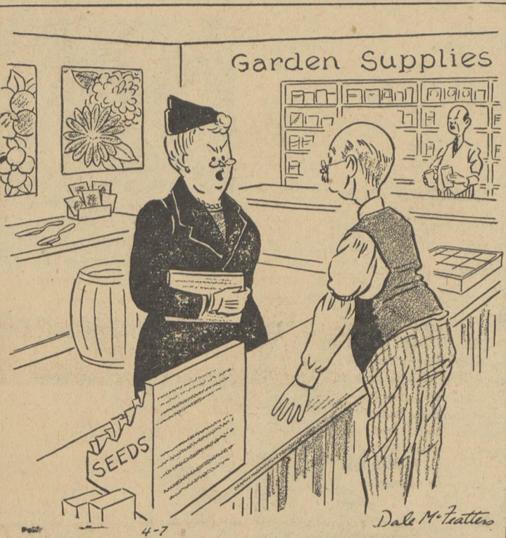
"Those trumpet vines you sold me last year—they never made a sound!"