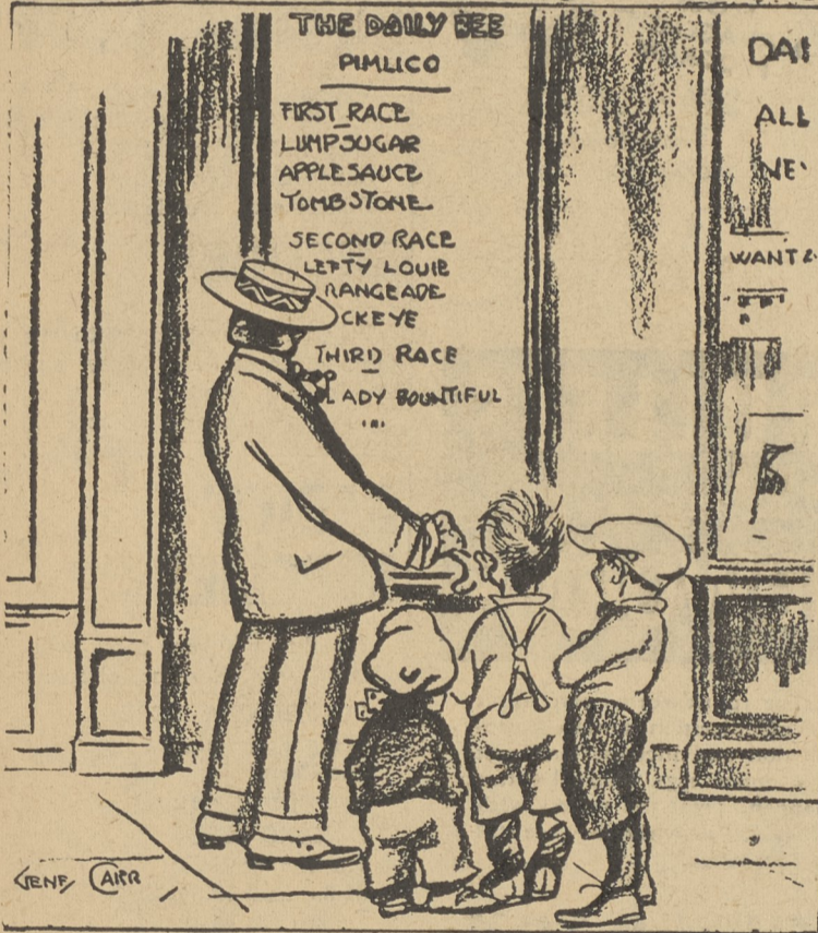
The Four Horsemen