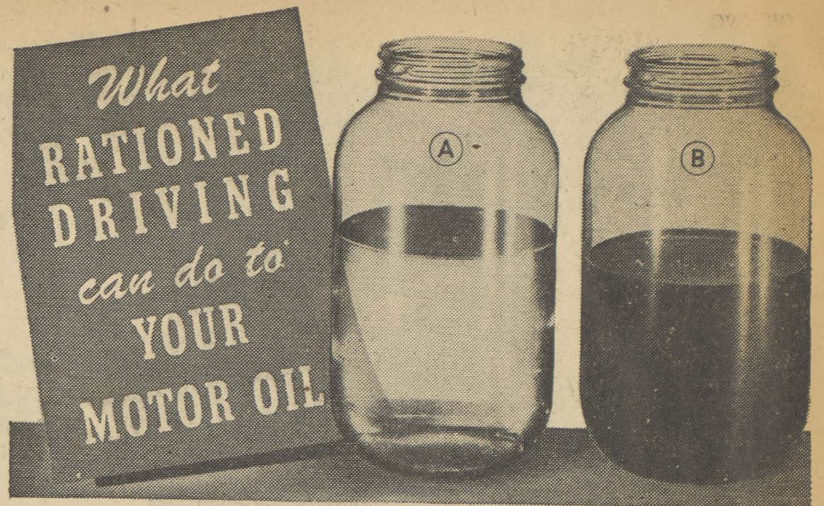
A Fresh, clean motor oil. B Same oil after only 721 miles of rationed driving. Oil is full of dangerous sludge.

HAY, FEED and STZDRY BROWN AND FASSETT R. F. D. No. 3, Dallas, Pa. (Fernbrook)