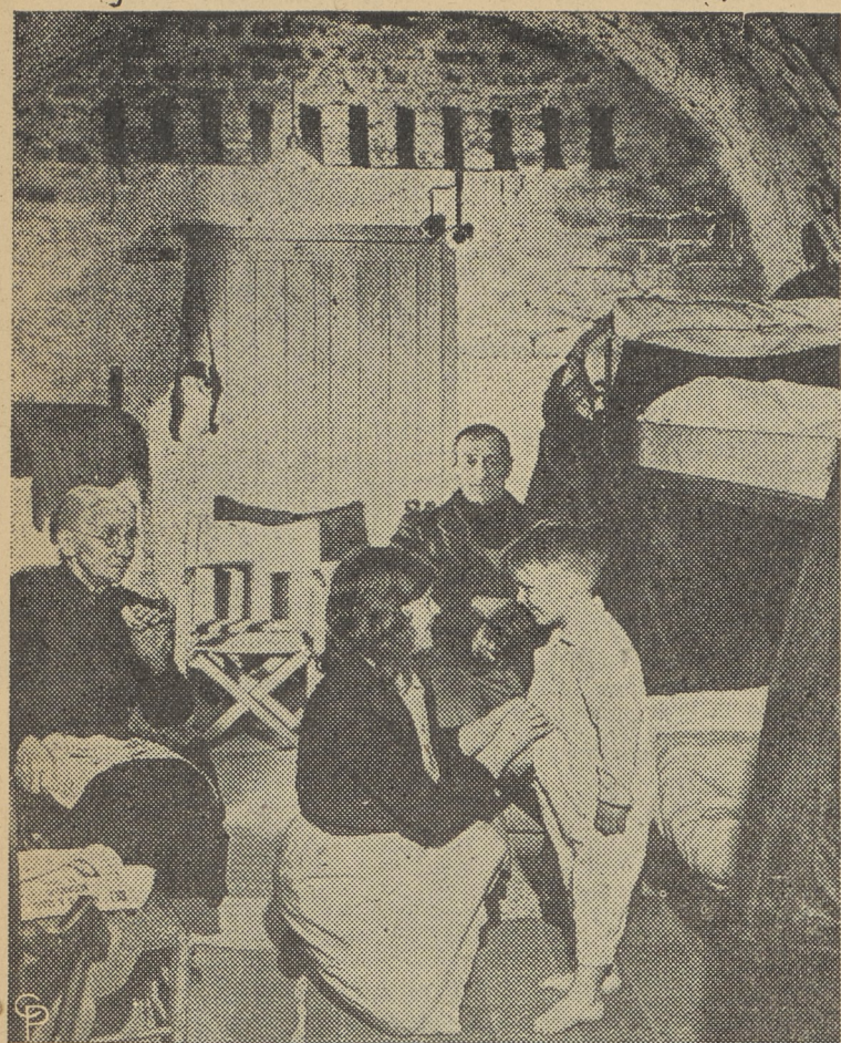
FREE AT LAST to leave the caves in which they have been living for four years, the men, women and children of Dover, Deal and Folkstone are now returning to their home and great is their rejoicing now that the last guns have been silenced at Cap Gris Nez. One of the most recent pictures taken of a "cave-dwelling" British family, shows a mother preparing a little Tommy for the "day of liberation."