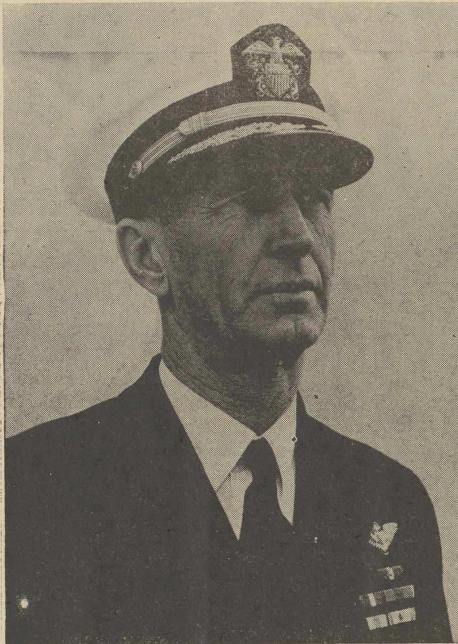
Admiral Ernest J. King—"The dollars of every patriotic American must continue to build invasion ships to transport our men and materials in increasing numbers to the many active fronts. In 1944, more than ever before, the money we invest in War Bonds is of supreme importance."