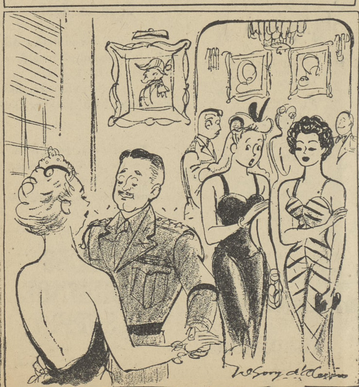
"It works just the way they rate the movies. The more stars they're given, the better they are!"