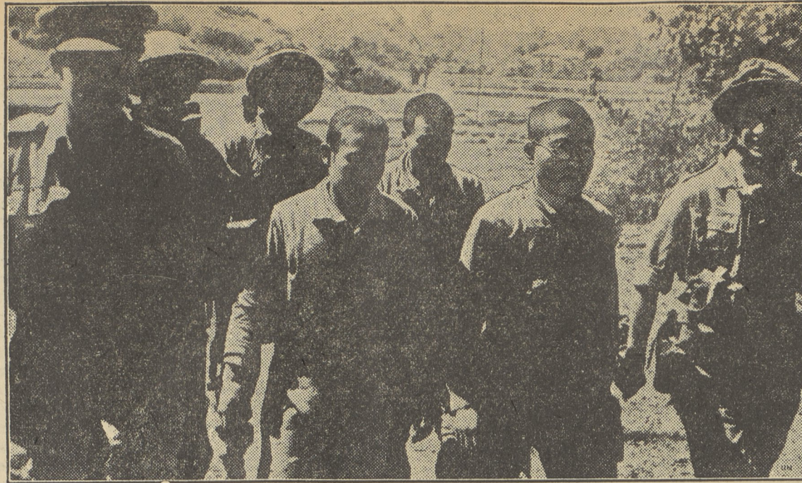
TO BE CAPTURED ALIVE is considered a disgrace by the Japanese and they usually fight suicidally rather than give in. This makes this picture unusual. The British tommyes are bringing in these three for questioning.