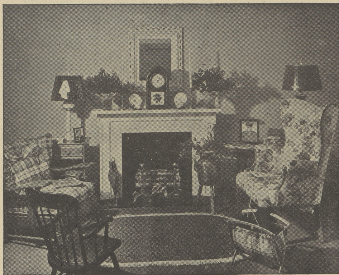
WANT a new, friendly room at little cost? Regrouping seldom costs much money, and transforms an old tired-looking room into a bright, cheery arrangement. Dorothy Draper, in the October issue of Good Housekeeping Magazine, shows you the effects of regrouping in typical rooms. In a before and after series, she shows what can be done with a little careful planning. The picture above gives you an idea of such a change.