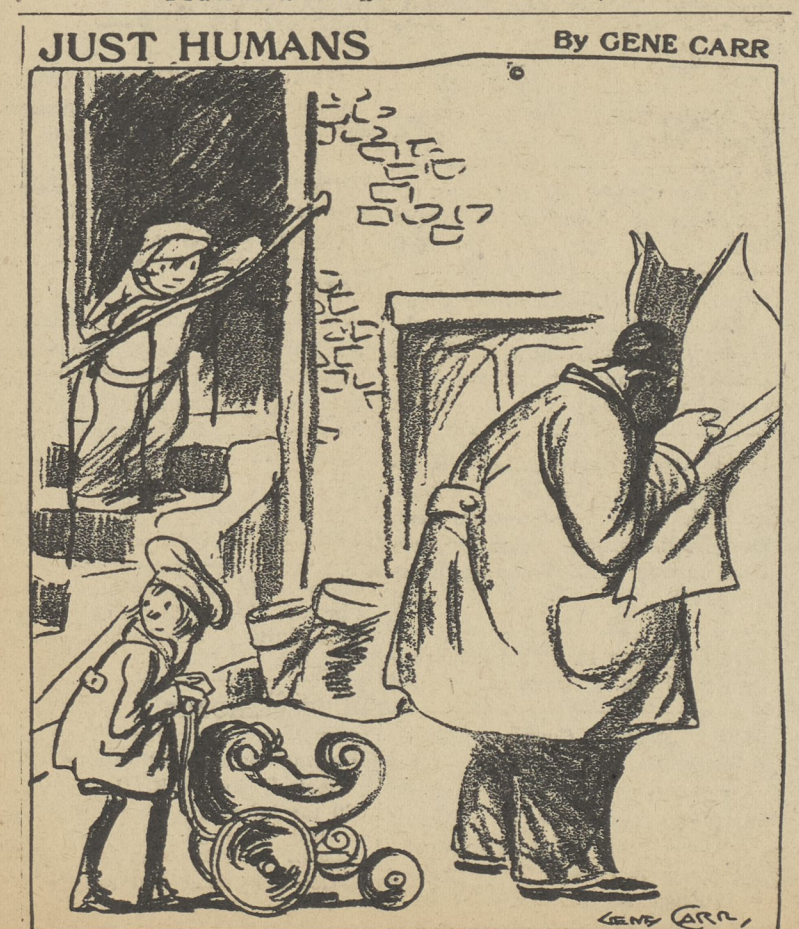
"Look Where You're Goin', Sis! Do Ya Want T'run That Fat Bird Over?"

"You'll find this gown launders well, too."