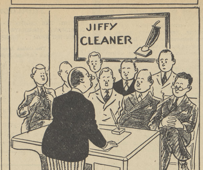
"The sales contest will be different this year—the prize will go to the man who dodges the most customers!"