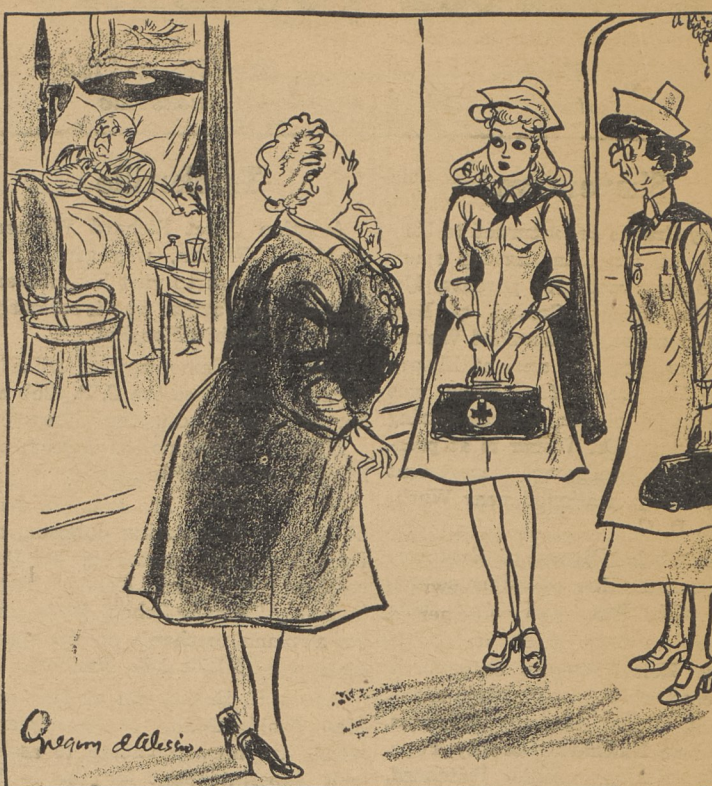
"H-m-m . . . no matter WHICH one of you I hire, he'll NEVER get well!"