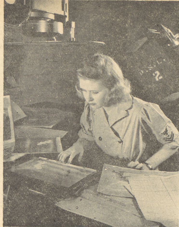
A Wave who finds her duty fascinating as she edits microfilm at Anacosta

Wave photographers must know how to use still, motion and aerial cameras of various kinds. They also do dark room work such as developing of film, printing and mounting of prints. Other duties include sorting of films and prints, splicing moving picture films and making and assembling aerial mapping photographs. They operate motion picture machines and