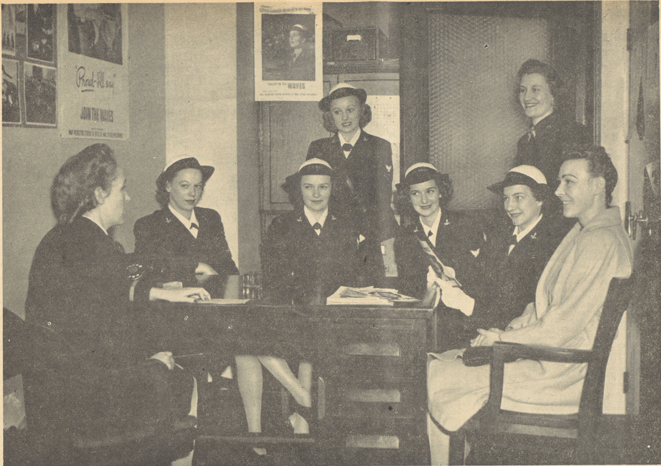
An enthusiastic group of Waves at the Wilkes-Barre Recruiting office.