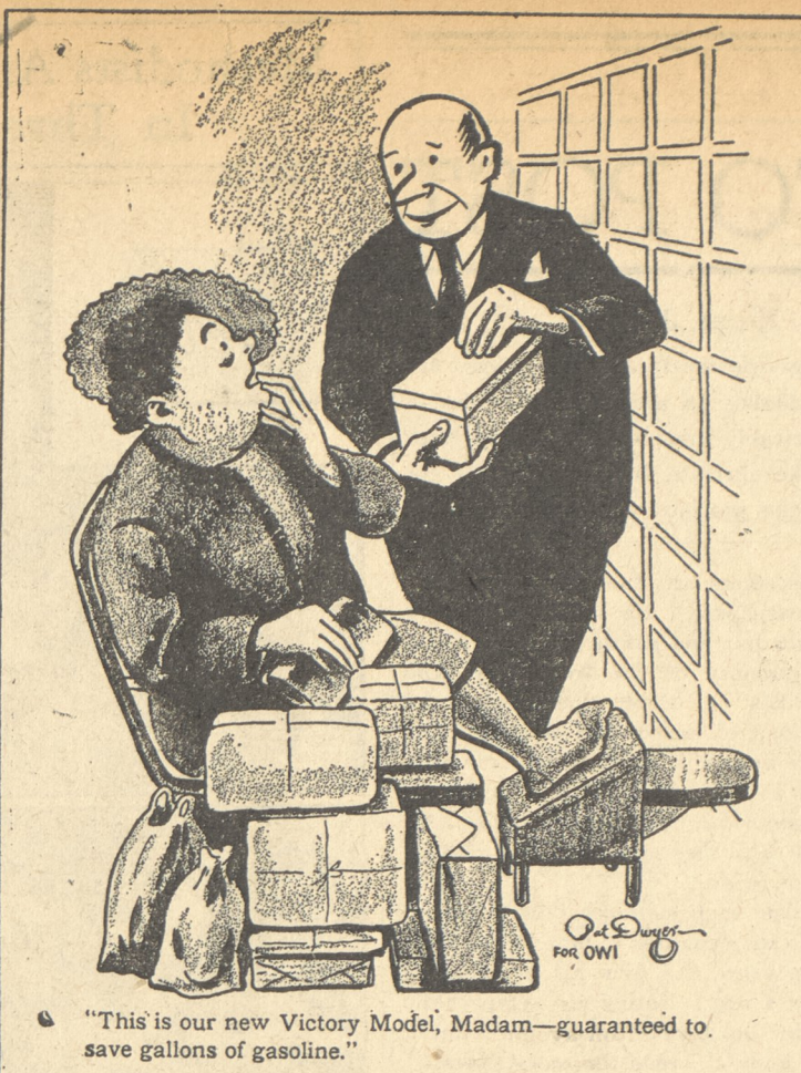
"This is our new Victory Model, Madam—guaranteed to save gallons of gasoline."

When men are in the saddle for hours, their saddles, saddle rolls and other equipment must be made to stand the wear. Complete with carbine and helmets, the equipment for the cavalryman runs into hundreds of dollars. You can help provide this with your War Bond purchases. If you have not done so, join the Payroll Savings Plan and put ten percent of your income into War Bonds. U. S. Treasury Department