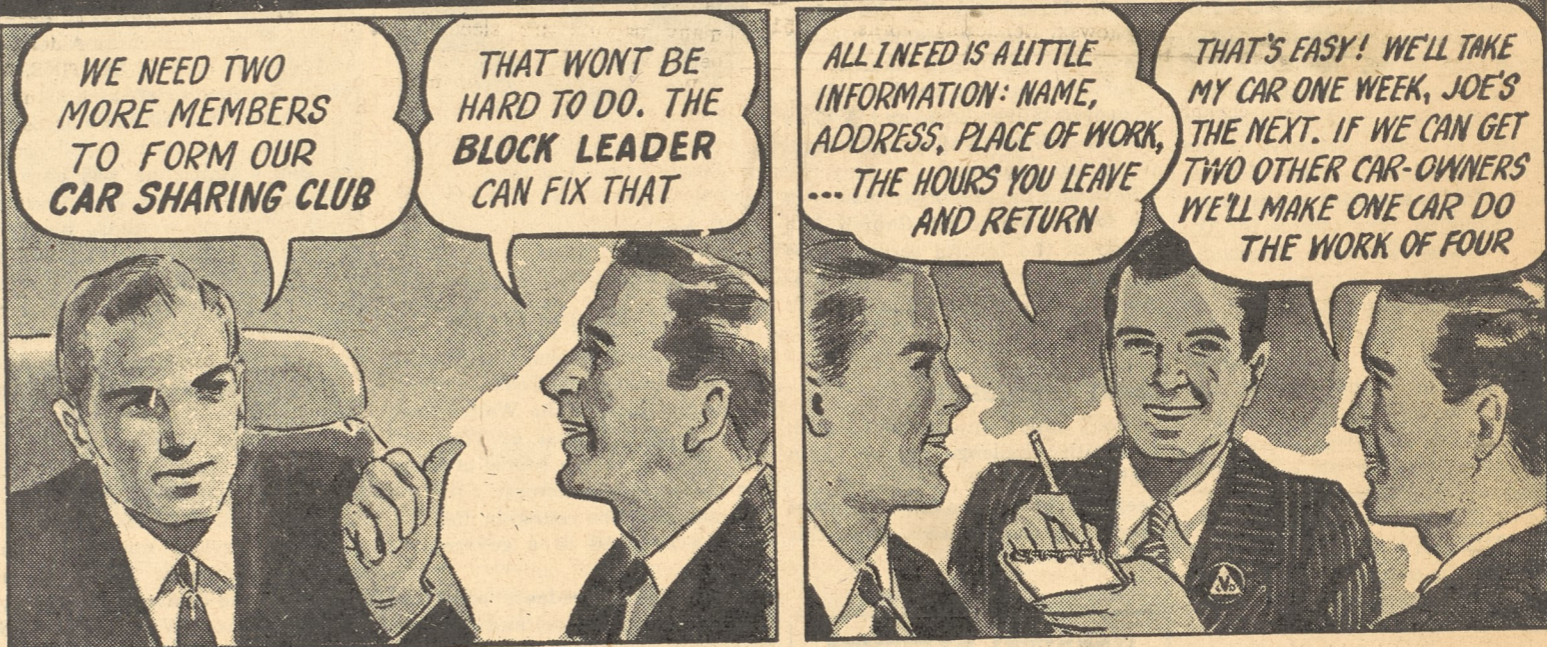
Ask your Civilian Defense Block Leader to help you find four car owners who work in the same part of town you do. All you have to do is call your local Defense Council.