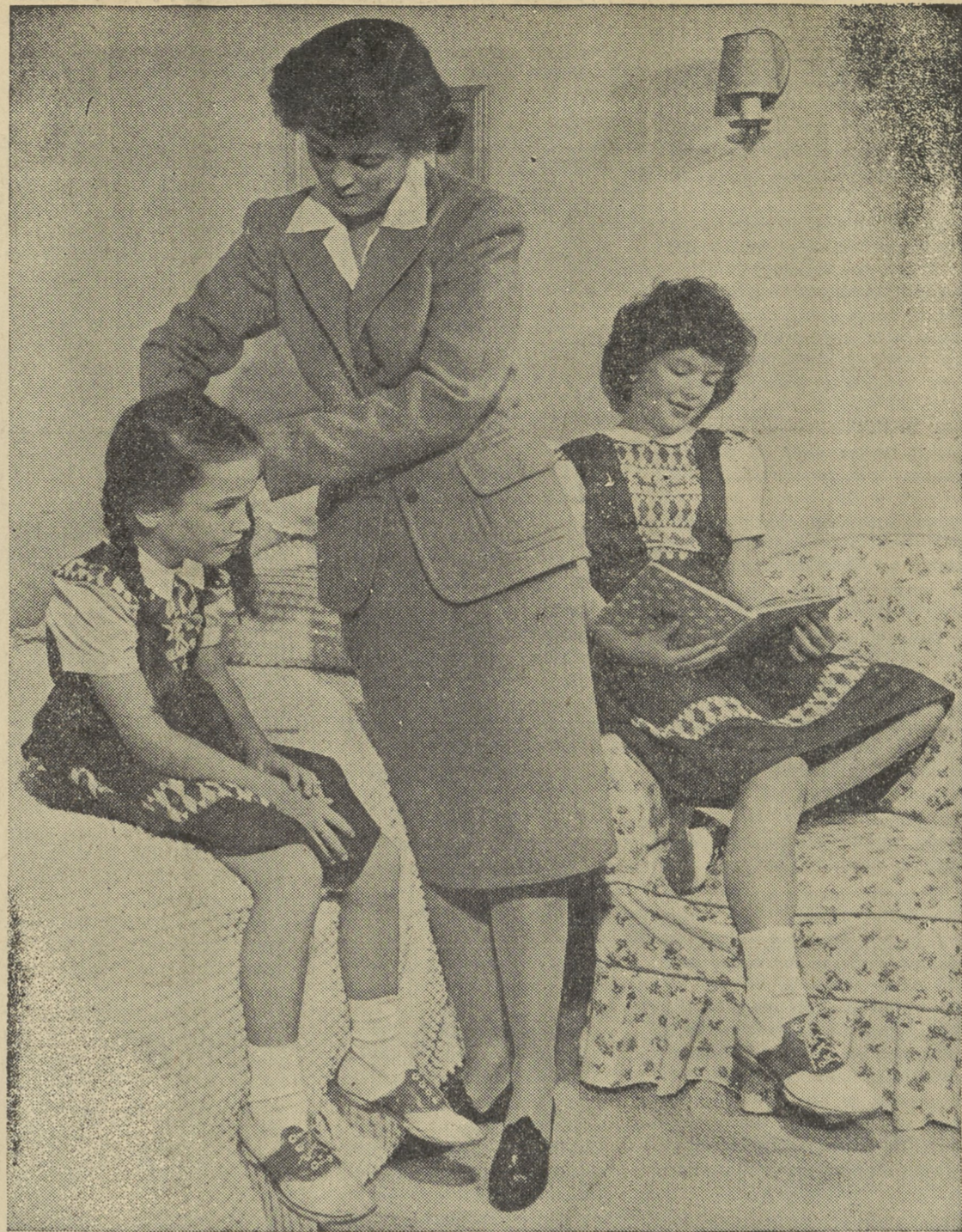
The well-tailored classic suit shown above is presented in the October issue of Good Housekeeping Magazine. The girls are wearing washable green cotton poplin with gay embroidery.