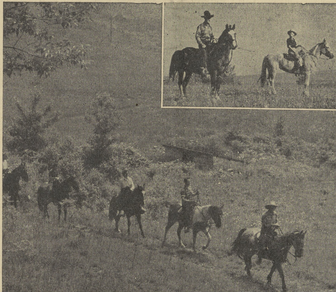
Pennsylvania dude ranches furnish all the thrills of the Old West in an Eastern setting—riding being the principal diversion. Above is pictured a string of riders off for a canter in the Pennsylvania hills.