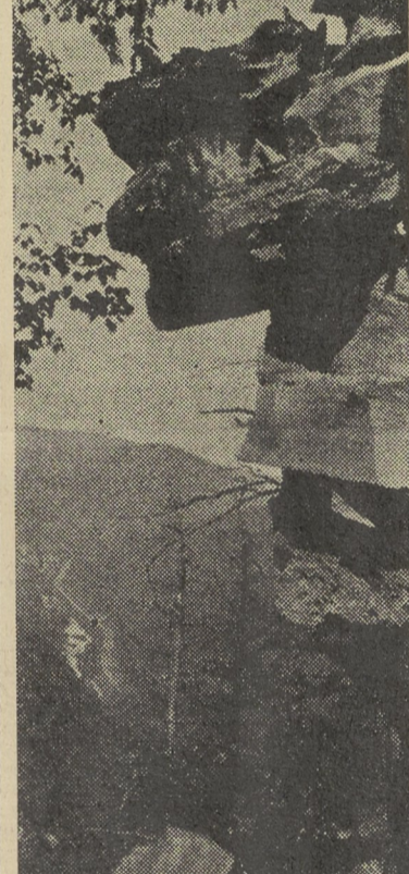
"Old Man of the Mountains" frowns down upon the Pine Creek Gorge known familiarly as the Grand Canyon of Pennsylvania. Near Wellsboro, the Canyon country is a favorite among vacationists.