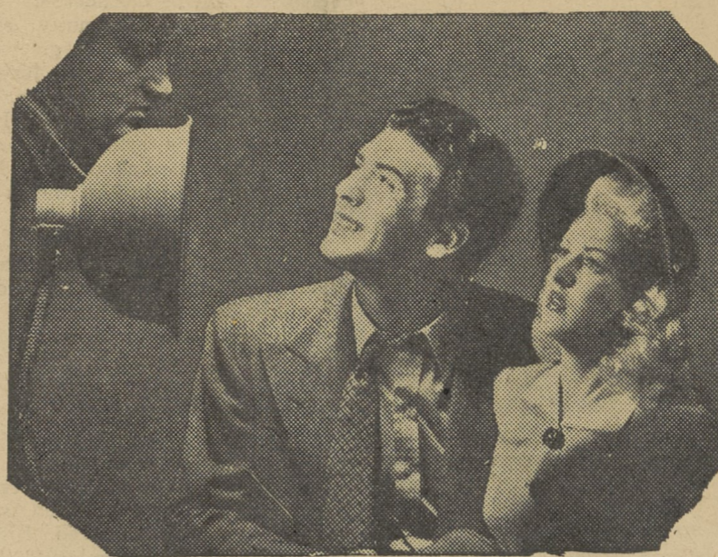
Above is a scene from "I Wake Up Screaming," now showing at the Capitol Theatre. The cast includes Betty Grable, Victor Mature, Carole Landis, Laird Cregar, William Gargan and others.

This Week Post Guests Can See "I Wake Up Screaming" Now At The CAPITOL Theatre