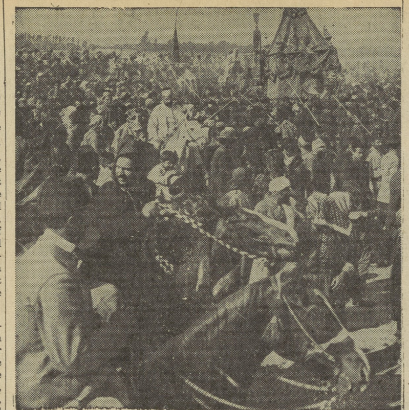
This scene was made during the annual procession of the Holy Carpet in Damascus, capital of Syria, first objective of British and Free French forces which marched into the French-mandated country. The Empire forces acted to occupy Syria to forestall similar action by the Axis.