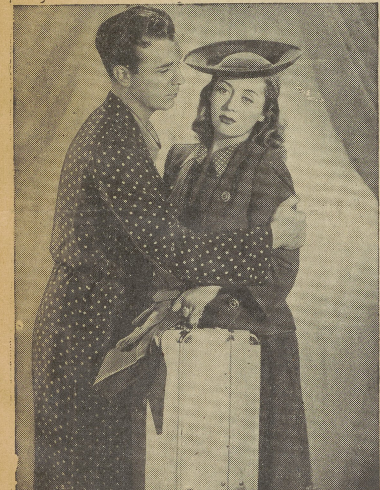
"You can go Brandon's way, or you can go mine, but you can't go both," she hear herself saying.