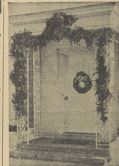
Evergreen festoons to decorate your doorway

To light a Christmas figure or creche put a bulb on a cord in a vase and throw light up on the figure. Silver leaves in the vase give a lovely glow and conceal the source of light.