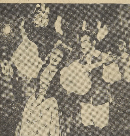
"Oh... nature has a way with the heart of a maid..."

Now, starting with the very first day, all of the wreck's survivors proceed to build a free settlement under Charles' guidance. In the weeks that pass, many of the bondsmen marry the brides intended for the planters and settle down happily. But between Charles and Marianne there is a burning antagonism.