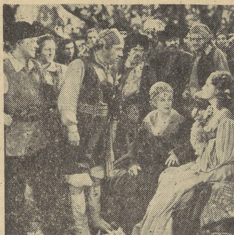
"Mademoiselle, you must obey the Chief..."

Marianne is unable to cope with Charles' sardonic laughter. The night there is a terrible storm and they are all cast on an island. Marianne, angry at Charles' domineering manner, tries using passive resistance against all his orders but he threatens to have his first henchman give her a spanking.