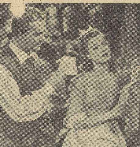
"What! Mademoiselle can actually wash her own linen?"

Marianne is unable to cope with Charles' sardonic laughter. The night there is a terrible storm and they are all cast on an island. Marianne, angry at Charles' domineering manner, tries using passive resistance against all his orders but he threatens to have his first henchman give her a spanking.