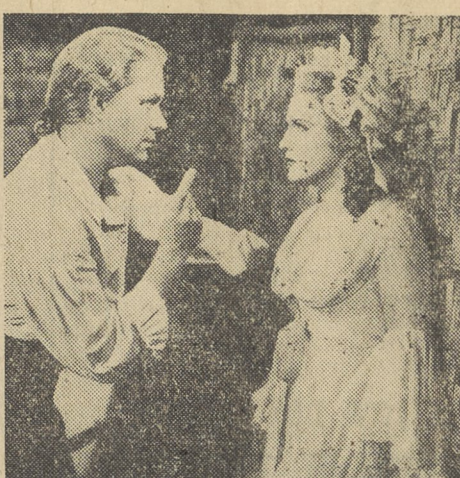
"You've made moonstruck Romeos out of all of them."

Marianne though, is repeating history, for she has become the belle of the island. All the young men seek her out to dance and sing and the gentry is especially pleasurable to her since it seems to arouse Charles' anger. One night she is on her balcony, being serenaded by a group of adoring young men.