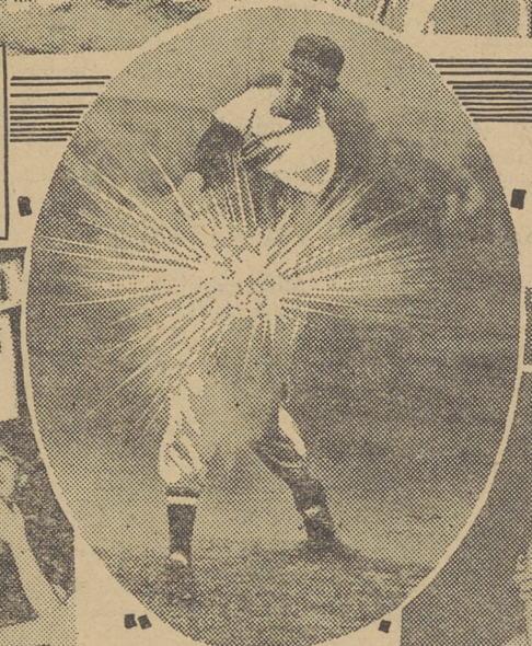
SARASOTA, Fla. —Ted Williams, Boston Red Sox sensational outfielder, takes swing at juicy Florida "health-bomb" grapefruit at Spring camp.