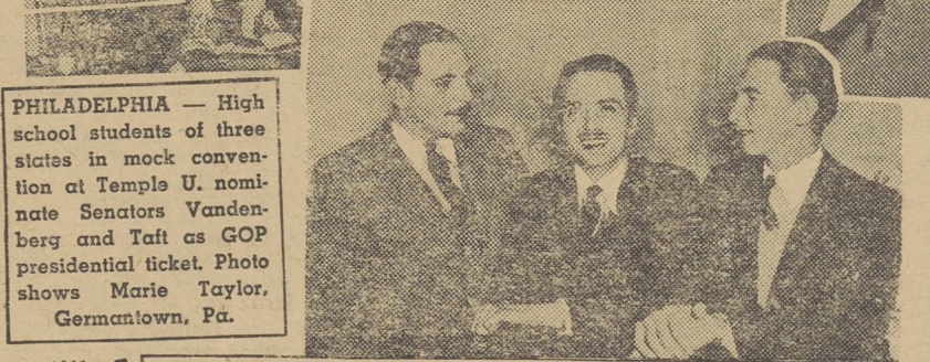
NEW YORK CITY —Archduke Otto of Hapsburg, pretender to Austro-Hungarian throne, photographed with his aide (left) and his brother, Archduke Felix, after his arrival "to study American democracy"