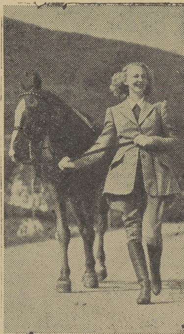
At the end of the trail beautiful Virginia Bruce leads her mount to the stables and an extra helping of hay.