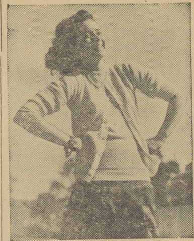
Sweater twins are the mainstay of college girls for everyday wear. This classic set comprises a slip-on with a ribbed round neck and a ribbon-bound cardigan. Smart collegiates wear the long sleeves pushed above their elbows and affect single-strand pearls over the top button of the cardigan.