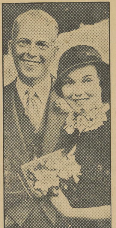
You've heard of people winning a hand of faro, but here's a case where a Farrow won a hand, that of Maureen O'Sullivan. The screen star and John Farrow, her fiance, are pictured above smiling their happiness at their forthcoming marriage. He's a Hollywood film writer.