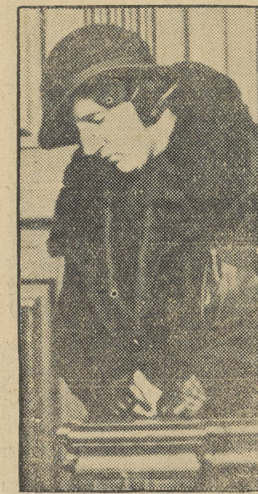
The guillotine will end the life of Violette Nozieres, 18, shown here in the Paris courtroom where she was convicted of the poison murder of her father and the attempted murder of her mother. Her case brought suspicion on many Parisians named Emile, as she mentioned a mysterious "Emile," never identified as her "protector."